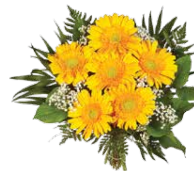
GERBERA BOUQUETS Assorted colours and sizes