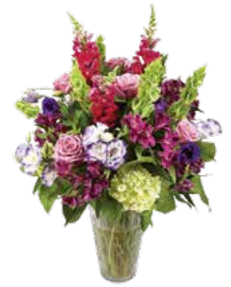
CUSTOM MADE ORNATE ARRANGEMENT