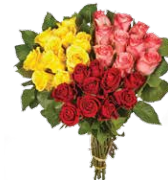
INTERMEDIATE ROSES – FAIRTRADE Assorted Colours, 10 stem bunch