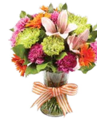
CUSTOM CLASSIC ARRANGEMENT