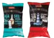
IRRESISTIBLES KETTLE CHIPS 150g