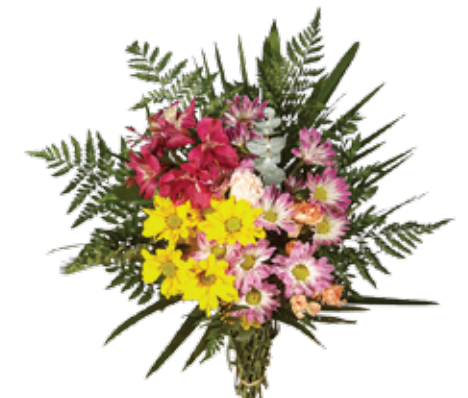
MIXED BOUQUETS Assorted varieties guaranteed to last 10 days