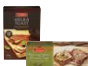
IRRESISTIBLES CRISP CRACKERS, THINS, WATER CRACKERS, MELBA ROUNDS, ETC