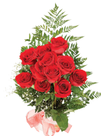
PREMIUM DOZEN ROSES Assorted colours