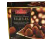
IRRESISTIBLES TRUFFLES 200g