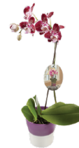
PREMIUM ORCHIDS 5" ceramic pot - Assorted colours