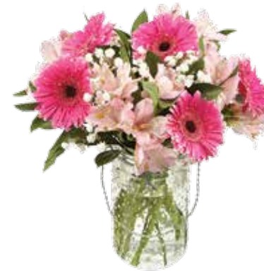
CUSTOM GERBERA AND ALSTROEMERIA CENTERPIECE

From the budget friendly to ornate, one of our certified floral designers is always ready to create a custom centerpiece or bouquet just for you. Select from one of our many ready-made bouquets, which are sure to put a smile on everyone's face.